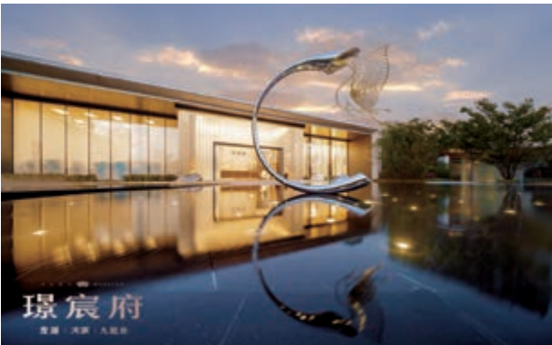
杭州環宸府 Hangzhou Jade Mansion