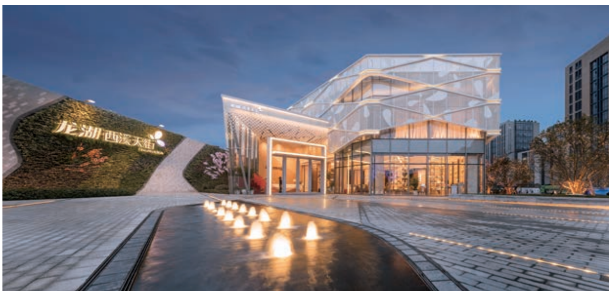
杭州西溪天街 Hangzhou xixi Paradise walk