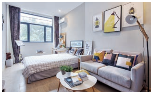
冠寓武漢發展二路店 Champion Apartment Wuhan