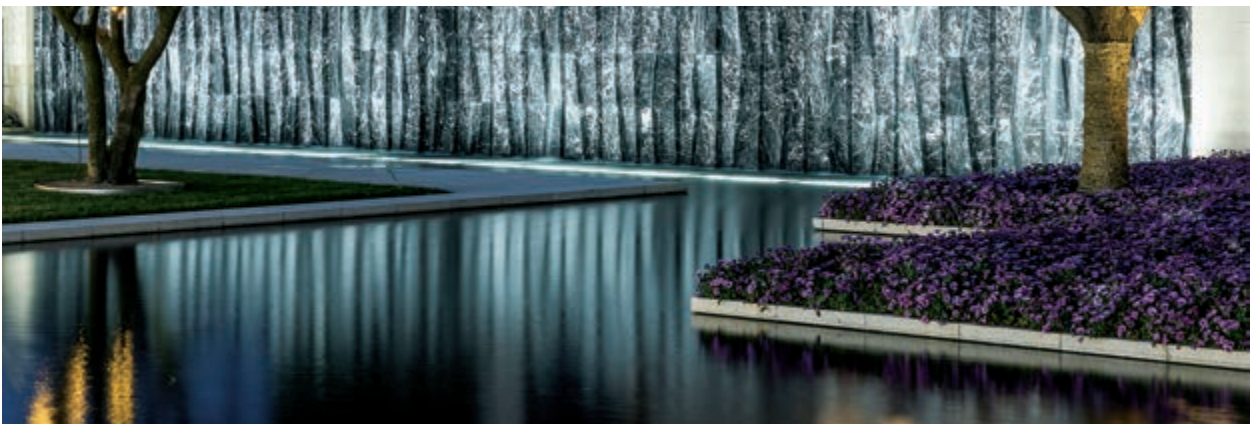
杭州春江天璽 Hangzhou Chunjiang Mansion