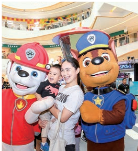
常州龍城天街 Changzhou Longcheng Paradise walk