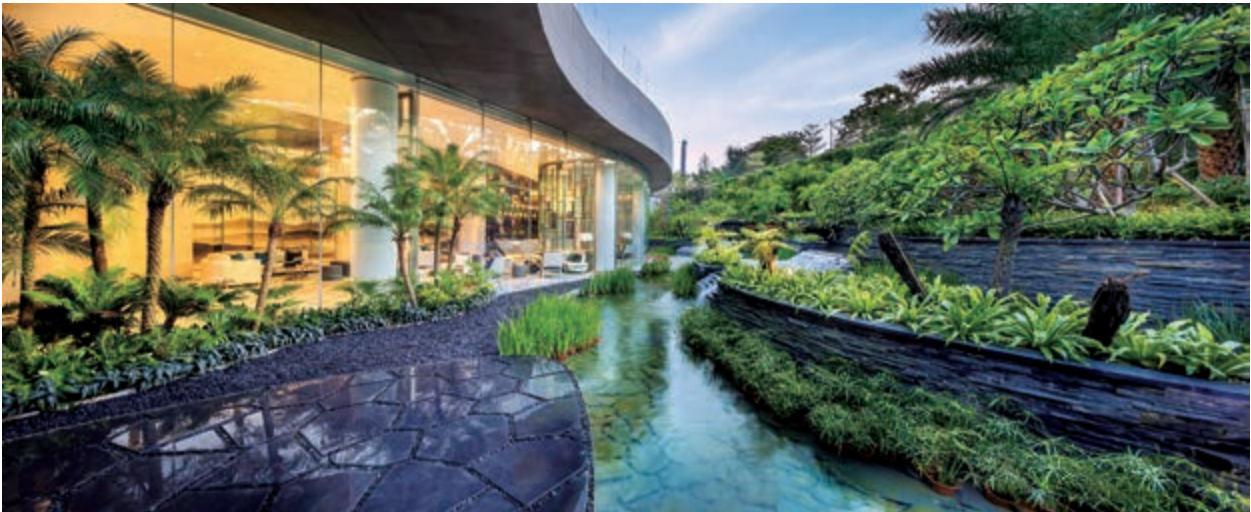
廣州天奕 Guangzhou Tian Yi

In the constantly changing market and diversifying competition landscape, the Group will continue to maintain a prudent and rational financial management strategy in order to preserve our low-cost and multi-channel advantages in funding and maintain a reasonable gearing ratio. In terms of investments, we will also control land cost and increase funding utilization rate through external co-operations and acquisitions in the secondary market.