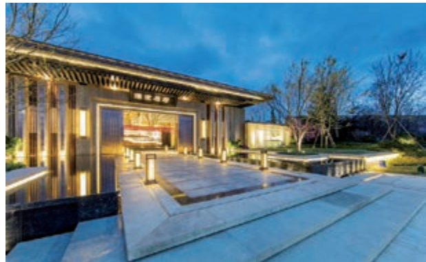
青島環宸原著 Qingdao Jing Chen Longfor Mansion