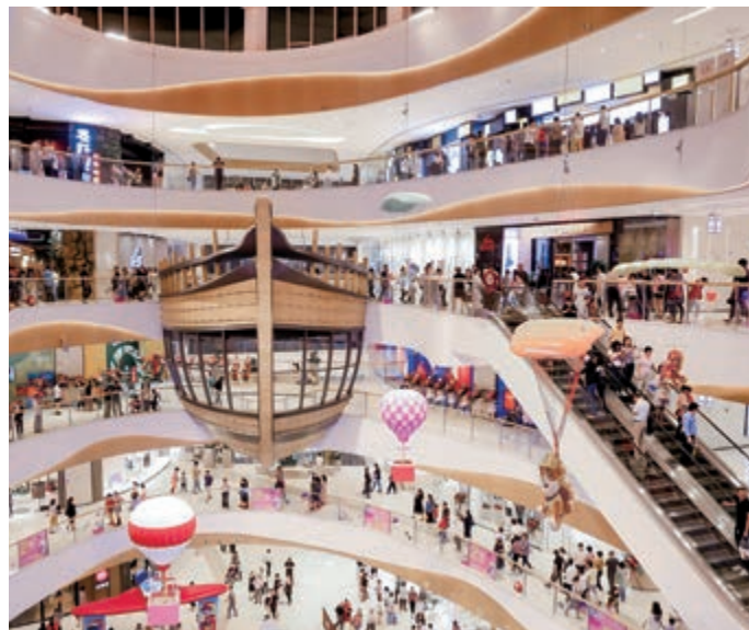
常州龍城天街 Changzhou Longcheng Paradise walk