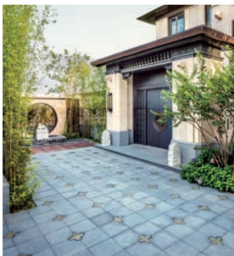
北京景粼原著 Beijing Jing Lin Lognfor Mansion

In 2018, revenue from property development business of the Group was RMB108.72 billion, representing an increase of 61.2% as compared to last year. The Group delivered 8.18 million square meters of property in gross floor area (GFA) terms. The gross profit margin of the overall property development business increased by 0.4% to 33.2% as compared to last year. Recognized average selling price was RMB13,296 per square meter in 2018.