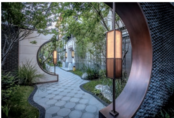
北京景粼原著 Beijing Jing Lin Lognfor Mansion