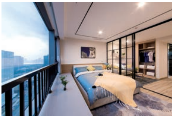
冠寓杭州奧體盈豐路店 Champion Apartment Hangzhou