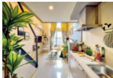
重慶冠寓 Chongqing Champion Apartments