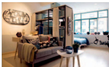
杭州冠寓 Hangzhou Champion Apartments

The Group has 14 shopping malls under construction with a total GFA of about 1.45 million square meters.