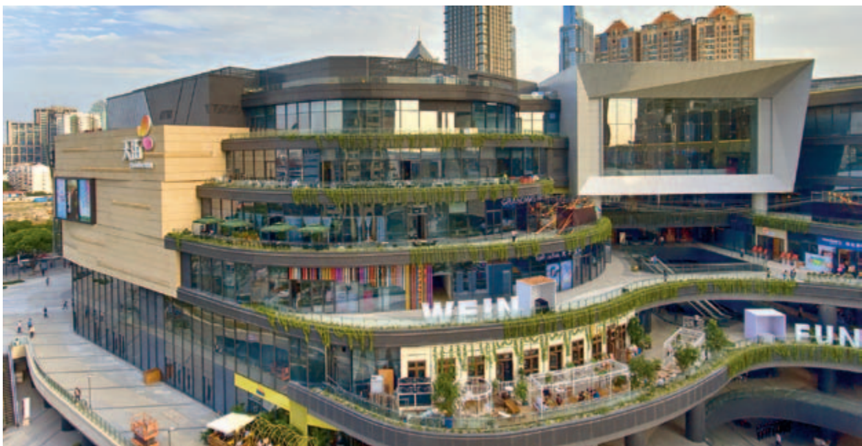
蘇州獅山天街 Suzhou Shishan Paradise Walk

In 2017, the rental income, net of tax, of the Group's property investment business was RMB2.59 billion, representing an increase of 35.6% as compared to last year. The sectors of Shopping malls, Champion Apartments and others accounted for 97.7%, 1.5% and 0.8% of the total rental income respectively. As at 31 December 2017, the Group has shopping malls of 2.58 million square meters (3.37 million square meters in GFA with parking space included) which have commenced operation with an occupancy rate of 95.3%. The GFA of Champion Apartments which have commenced operation is 0.58 million square meters, with an occupancy rate of 46.0%, among which, the average occupancy rate of projects which have commenced operation for more than three months is 67.1% while that of projects which have commenced operation for more than six months is 91.7%.