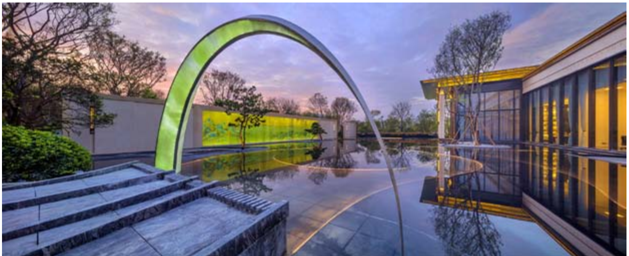
廈門景鄰原著 Xiamen Lognfor Mansion