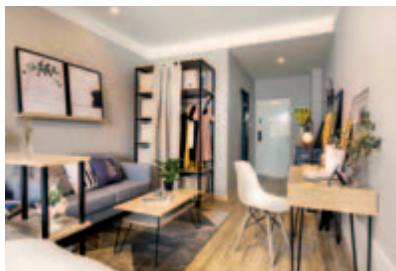
武漢冠寓 Wuhan Champion Apartments