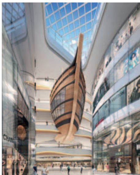
常州龍城天街 Changzhou Longcheng Paradise Walk

From January to June 2018, the rental income, net of tax, of the Group's property investment business was RMB1.85 billion, representing an increase of 62.8% over the same period last year. Shopping malls, Champion Apartments and others accounted for 90.7%, 7.5% and 1.8% of the total rental income respectively. As at June 30, 2018, the Group has shopping malls of 2.58 million square meters (3.37 million square meters in GFA with parking space included) which have commenced operation with an occupancy rate of 97.0%. The occupancy rate of Champion Apartments which have commenced operation was 76.2%, and of which have commenced operation for more than six months was 90.1%.