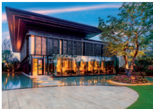
合肥紫雲賦 Heifei Zi Yun Fu