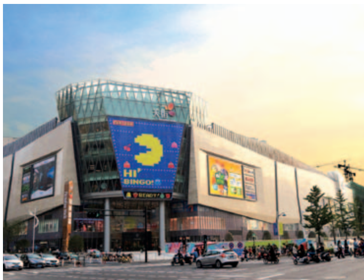
杭州濱江天街1期 Hangzhou Binjiang Paradise Walk Phase I