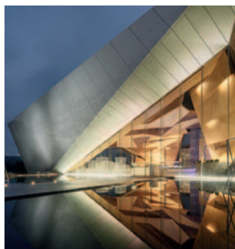
重慶昱湖壹號 Chongqing Waterfront City