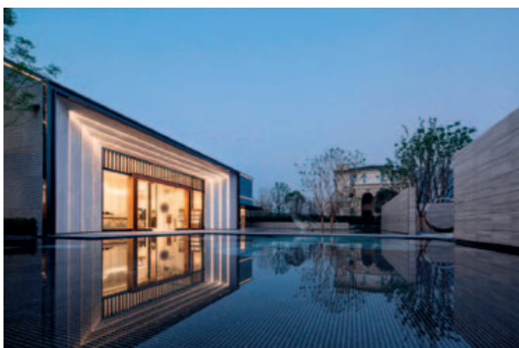
重慶椿山 Chongqing Chun Shan

From January to June 2018, revenue from property development business of the Group was RMB24.04 billion, representing an increase of 44.9% over the same period last year. The Group delivered 2.19 million square meters of property in gross floor area (GFA) terms. Gross profit margin of overall property development business increased by 0.3% to 34.8% over the same period last year. Recognized average selling price was RMB11,001 per square meter from January to June 2018.