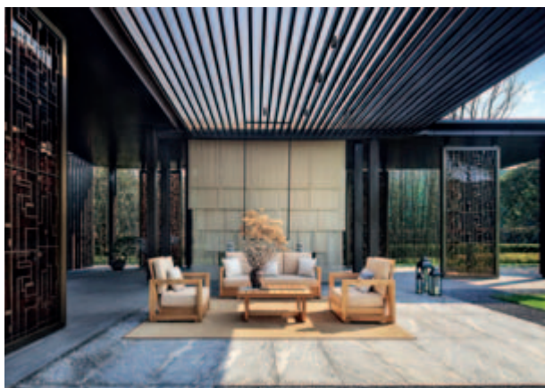
重慶九里晴川 Chongqing Jasper Sky