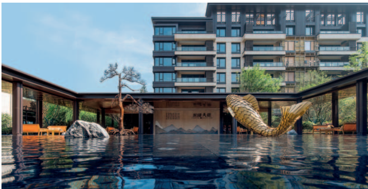
杭州天鉅 Hangzhou Longfor Mansion