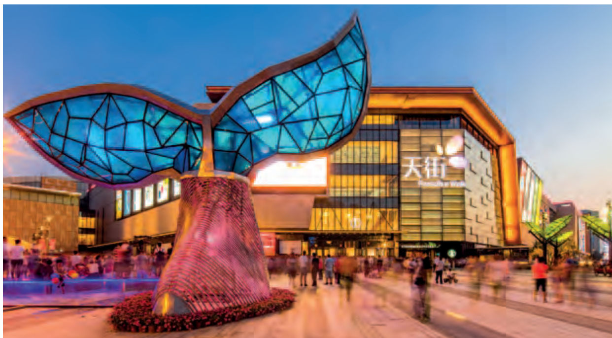
北京時代天街 Beijing Times Paradise Walk