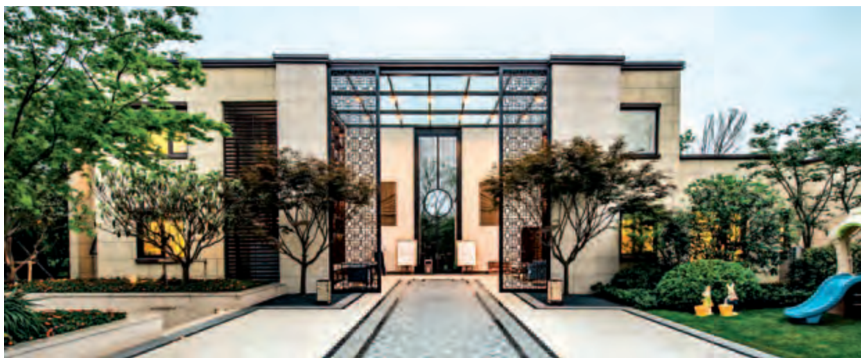
蘇州獅山原著 Suzhou Longfor Mansion

In 2016, revenue from property development business of the Group was RMB51.44 billion, representing an increase of 14.3% as compared to last year. The Group delivered 4,794,251 square meters of property in gross floor area (GFA) terms. The gross profit margin of the overall property development business increased by 1.4% to 27.6% as compared to last year. Recognized average selling price was RMB10,730 per square meter in 2016.