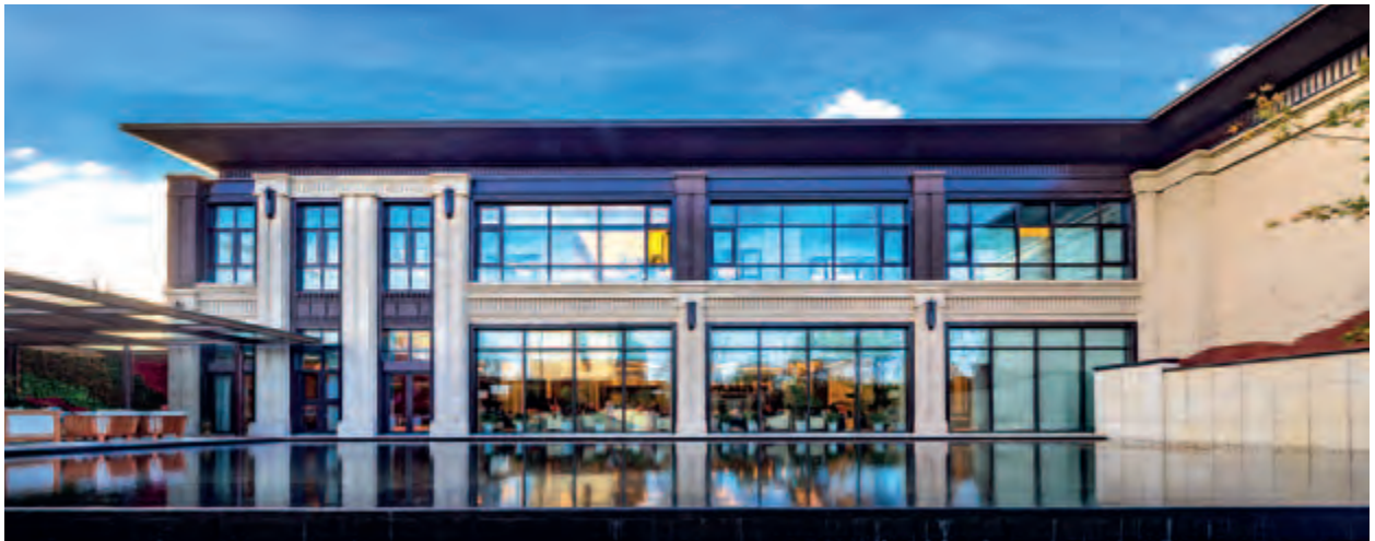
天津天宸原著 Taijin Longfor Mansion

In the market with accelerating integration and complicated changes, the Group will continue to maintain a prudent and rational financial management strategy. While preserving stable and healthy financial position and gearing ratio, we will control land cost and relieve funding pressure through external co-operations and acquisitions in the secondary market. At the same time, we will optimize the debt structure, explore new funding channels, extend debt maturity tenor and lower effective funding cost, in view of a depreciating trend of Renminbi, leading to a safer and healthier financial position of the company.