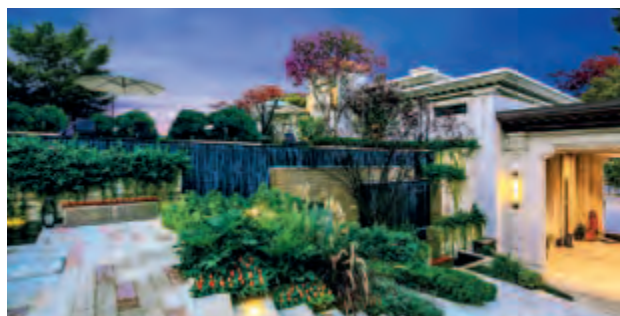
成都三千庭 Chengdu Poetic Life

In 2016, the Group achieved contracted sales of RMB88.14 billion, representing an increase of 61.6% as compared to last year. The Group sold 6,020,097 square meters in total GFA, representing an increase of 41.6% as compared to last year. Average selling price of GFA sold was RMB14,642 per square meter, representing an increase of 14.2% as compared to last year. Contracted sales from Yangtze River Delta, Pan Bohai Rim, western China, southern China and central China were RMB32.51 billion, RMB23.89 billion, RMB19.65 billion, RMB10.74 billion and RMB1.35 billion respectively, accounting for 36.9%, 27.1%, 22.3%, 12.2% and 1.5% of the contracted sales of the Group, respectively.