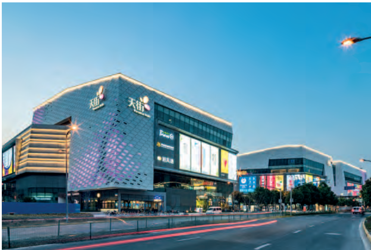
上海虹橋天街 Shanghai Hongqiao Paradise Walk