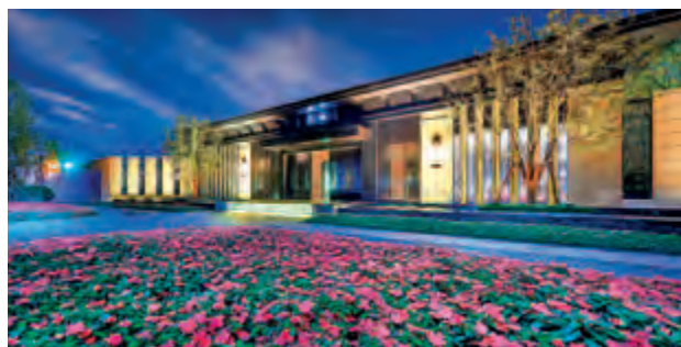
北京天琅 Beijing Glory Villa

Subsequent to the end of the reporting period, the Group successfully issued domestic green bonds denominated in Renminbi and raised a total of RMB4.04 billion in February, March 2017 with fixed rates ranged from 4.40% to 4.75% per annum and terms ranged from five to seven years.