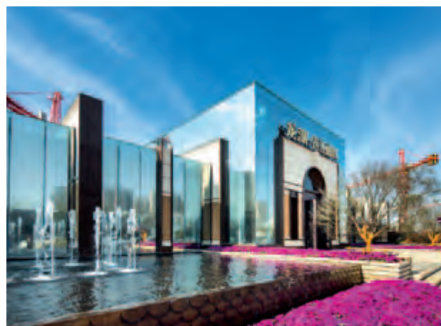
南京春江郦城 Nanjing Chunjiang Central