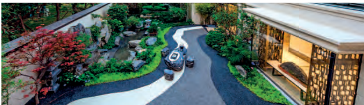
北京景粵原著 Beijing Orient Original