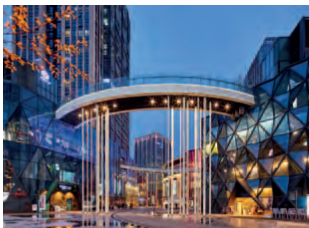
重慶時代天街 Chongqing Times Paradise Walk