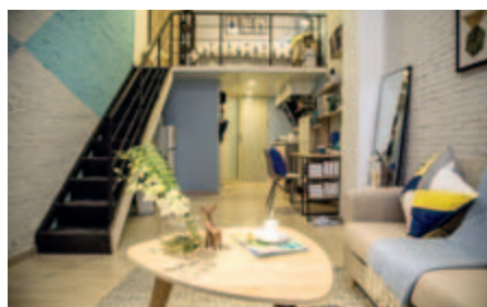
深圳冠寓 Shenzhen Champion Apartments