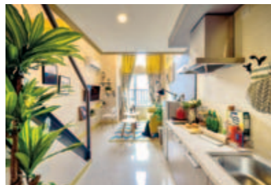
重慶冠寓 Chongqing Champion Apartments