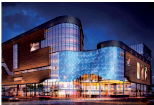
杭州金沙天街 Hangzhou Jinsha Paradise Walk

Due to the commencement of construction of new investment properties, the valuation gain of investment properties of the Group amounted to RMB2.22 billion from January to June 2015.