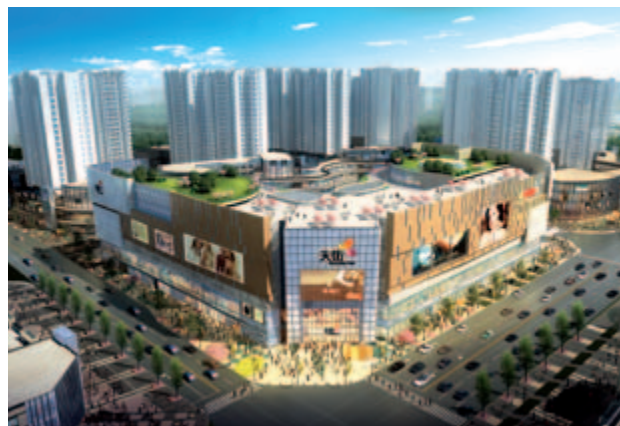
成都金楠天街 Chengdu Jinnan Paradise Walk