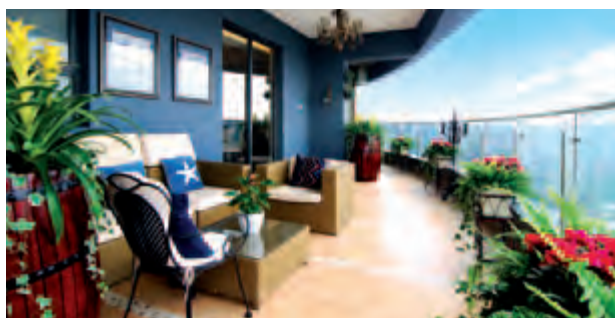
成都世紀峰景 Chengdu Century Peak View