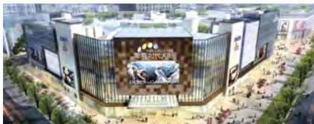
成都時代天街 Chengdu Times Paradise Walk

In 2014, the Group early redeemed of US$750 million 9.5% senior notes and completed two financing transactions in the international capital market, which effectively reduced the cost of financing. In March 2014, the Group entered into a lending agreement with a syndicate of 8 banks, and obtained 5-year syndicated loans of HK$2,450 million and US$125 million in a total of approximately HK$3,425 million at an interest rate of Hibor plus 3.1%. After the successful issue of three tranche of bonds denominated in US dollar, the Group entered into the dim sum bonds market for the first time, which further broadened the financing channels of the Company. In May, the Group successfully issued 4-year bonds of RMB2 billion in the international capital market at a nominal interest rate of 6.75%, which was the longest tenor and largest scale dim sum bonds issued by Mainland property developer.