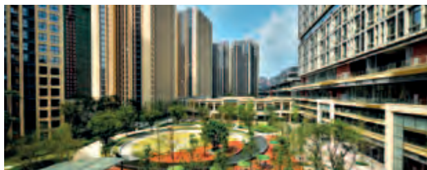
成都時代天街住宅 Residential Apartment of Chengdu Times Paradise Walk