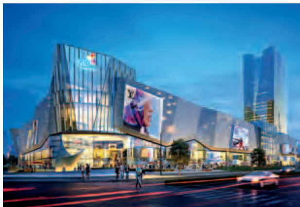
杭州濱江天街 Hangzhou Binjiang Paradise Walk