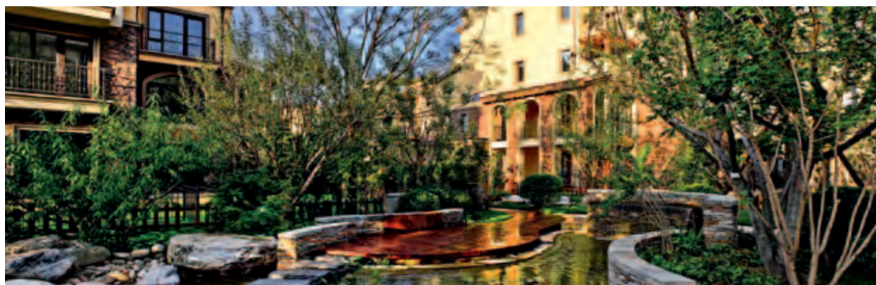
北京好望山 Beijing Hill of Good Hope