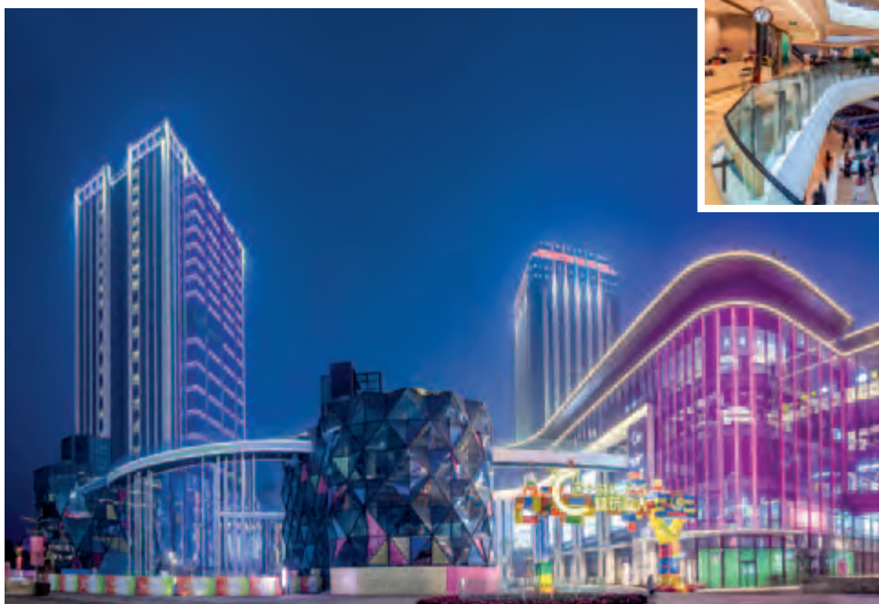
重慶時代天街 Chongqing Time Paradise Walk

The Group maintains a prudent property investment strategy. Currently, all investment properties of the Group are shopping malls under three major product series, namely Paradise Walk series, which are metropolitan shopping malls, Starry Street series, which are community shopping malls, and MOCO, which are mid to high-end household and lifestyle shopping centers. As at December 31, 2014, the Group has investment properties of 1,245,137 square meters (1,588,437 square meters in GFA with parking space included) which have commenced operation with an occupancy rate of 95.5%. Total rent reached about RMB930 million. Rental income, net of sales tax, was about RMB880 million, representing an increase of 38.1% as compared with last year. The series of Paradise Walk, Starry Street and MOCO accounted for 83.1%, 13.4% and 3.5% of the total rent respectively, and recorded increases of 42.2%, 20.8% and 21.0% respectively.