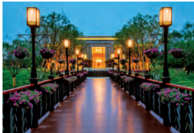
濟南名景台 Jinan Ming Jing Tai