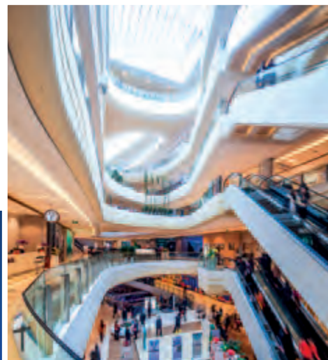
重慶時代天街內場 Interior of Chongqing Time Paradise Walk