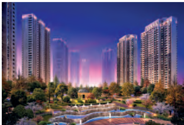
杭州春江郞城 Hangzhou Chunjiang Central

As at December 31, 2014, the Group had RMB52.0 billion (derived from 4,820,000 square meters) sold but unrecognized contracted sales which formed a solid basis for the Group's future sustainable and stable growth in revenue.