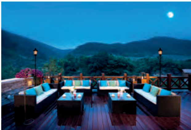
大連麓瀾山 Dailin Rose and Ginkgo Villa