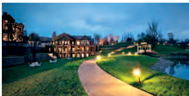
成都悠山郡 Chengdu Peace Hill County