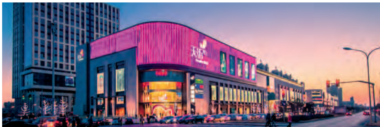
北京長楹天街 Beijing Changying Paradise Walk

The Group has 7 shopping malls under construction with a total GFA of about 864,000 square meters.