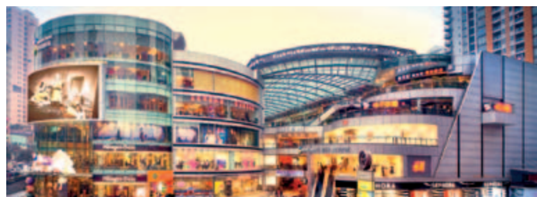
重慶北城天街 Chongqing North Paradise Walk