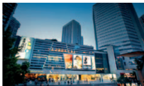
重慶西城天街 Chongqing West Paradise Walk