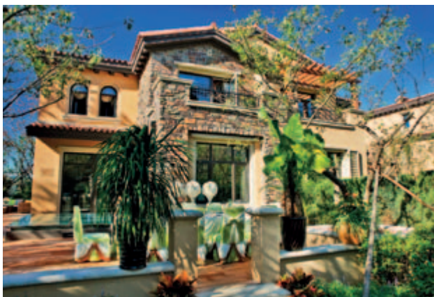
沈陽澗山 Shenyang Rose & Gingko Villa