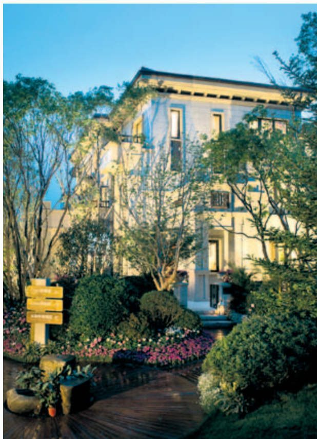
大連澗山 Dalian Rose & Gingko Villa