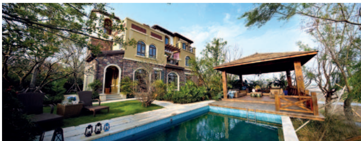
寧波澗瀾海岸 Ningbo Rose & Gingko Coast

In 2013, the Group successfully completed two financing transactions in the international capital market, which effectively extended the term of indebtedness of the Group and reduced the cost of financing. In January 2013, the Group successfully issued 10-year bonds of US$500 million at a nominal interest rate of 6.75%. The interest rate was lower than the 7-year bond issued in October 2012 at a nominal interest rate of 6.875%. In July 2013, the Group entered into a lending agreement with a syndicate of 13 banks, and obtained 4-year transferrable fixed term loan financing of HK$6,385 million and US$165 million in a total of approximately HK$7,672 million at an interest rate of Hibor plus 3.10%.