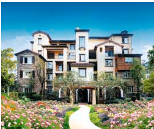
杭州潤潤山 Hangzhou Rose & Ginkgo Villa

Lastly, on behalf of the Board, I would like to express my sincere appreciation to all of our employees for their diligence and all of our shareholders for their support in the first half of the year.