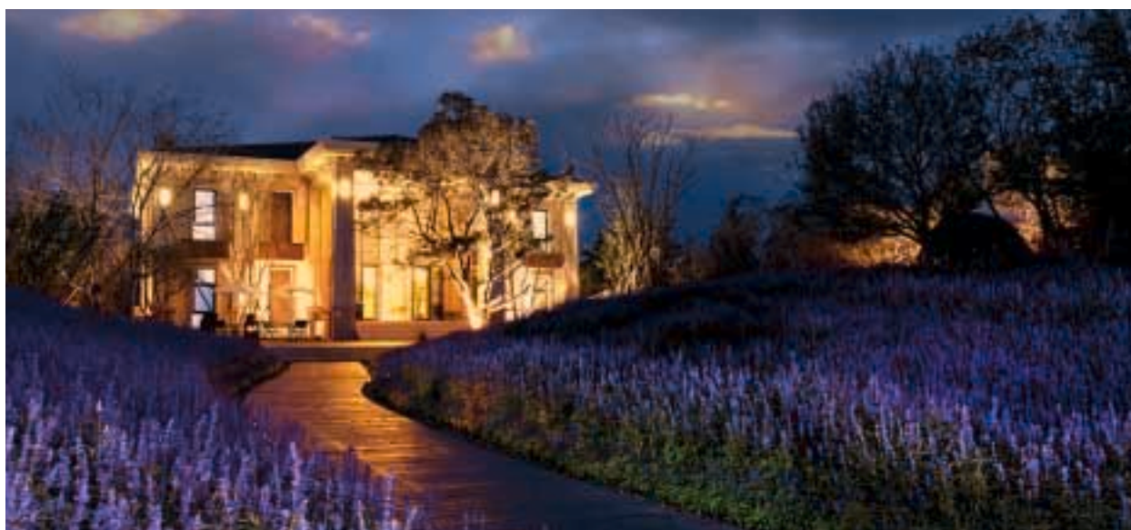
煙台葡醍海灣 Yantai Banyan Bay

In respect of product line, as the first integrated tourism real estate project, the Yantai Banyan Bay (Island of Horse) Project has commenced its sample display area in mid June. Its unique design and outstanding quality has been well recognized by the market. It commenced sales on 29 July 2011 and 1,002 units were sold with an aggregate value of RMB2.0 billion, breaking the record high in such a new market with an annual transaction amount of less than RMB30 billion. In addition, the Group will also increase the sales of commercial projects to an appropriate level so as to mitigate the effects of the purchase limit policy.