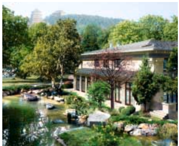
北京頤和原著 Beijing Summer Palace Splendor