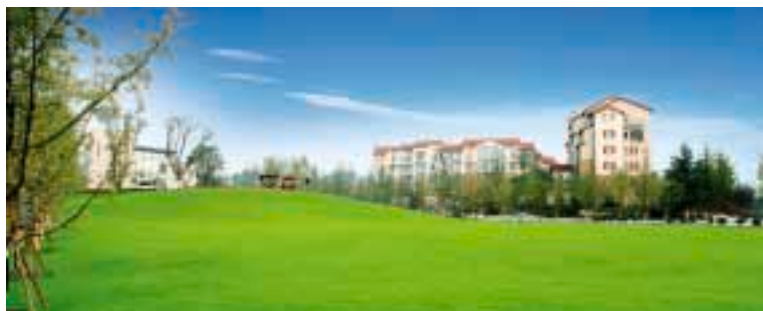
重慶江與城 Chongqing Bamboo Grove