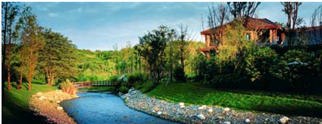
成都長橋郡 Chengdu Bridge County

As of June 30, 2011, the total Group's land bank was 33.25 million square meters or 29.89 million square meters on an attributable basis. The average unit acquisition cost of our land bank was RMB1,778 per square meter. Geographically, land bank in Pan Bohai Rim, Yangtze River Delta and western China accounted for 39.4%, 18.7% and 41.9% of the total land bank, respectively.