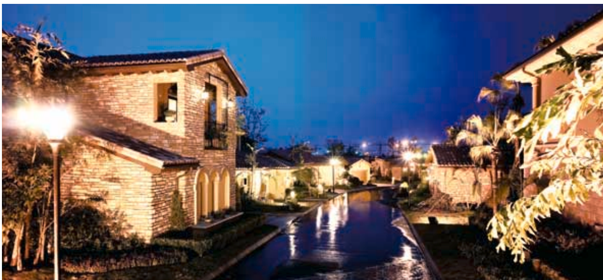
重慶藍湖郡 Chongqing Blue Lake County

From January to June 2011, revenue from property development business of the Group was RMB7.55 billion. The Group delivered 482,282 square meters of property in GFA terms, of which 7,562 square meters belonged to two jointly controlled entities, and it represents an increase of 117.7% and 1.49% as compared with the corresponding period of last year, respectively. With the recognition of high margin projects such as Beijing Summer Palace Splendor, gross profit margin of overall property development business rose from 29.9% in the first half of year 2010 to 54.9% in the same period of 2011. Recognized average selling price was RMB15,904 per square meters or RMB8,587 after excluding the Beijing Summer Palace Splendor project from January to June 2011.