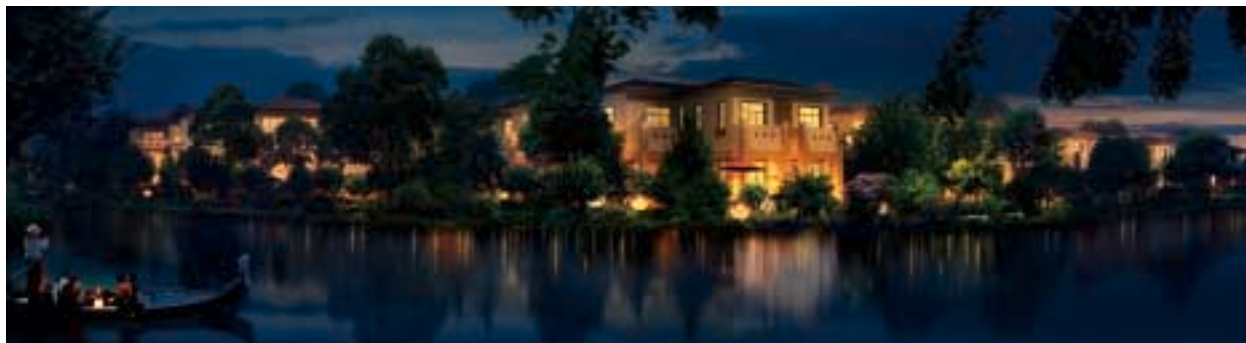
煙台葡醍海灣 Yantai Banyan Bay

In the second half of 2011, the real estate market in mainland China will continue to be affected by government's tightening measures. To achieve our sales target of this year, the Group will continue to carry out a proactive sales strategy and make every effort to ensure adequate growth of contract sales. In the second half of 2011, the Group will launch 13 new projects in addition to the current 33 projects available for sales. The Group's products will cater to customers with various demands including those who are seeking first-time housing, and those who are seeking further upgrade. The Group launched a brand new tourism and leisure related property project in Yantai, Shandong in July 2011, achieving sales of RMB2.0 billion on the first day available for sale and diversifying the Group's product portfolio. Adhering to our business strategy of "multiple products line", the Group will adjust and optimize its operation and product portfolio in response to the evolving market conditions so that the quantity and types of products will satisfy market demand for us to grasp the opportunity.