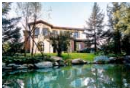
北京灩澗山 Beijing Rose & Ginkgo Villa

The cost of land bank of the Group only accounted for 14.3% of unit contract sales price as of June 30, 2011. The Directors believe that the Group's costs for land acquisition in the past were highly competitive. When these projects gradually fall in delivery phases in the coming years, the Group's gross profit margin should remain at high level, assuming property prices remain stable.