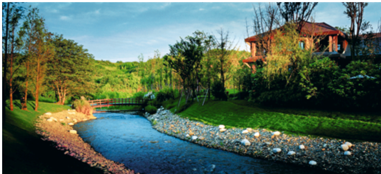
成都長橋郡 Chengdu Bridge County

The core net profit margin of the Group (profit attributable to equity shareholders excluding revaluation gain on investment properties to revenue) increased from 14.2% in 2009 to 17.1% in 2010. This is mainly due to the increase in the gross profit margin of property sales and effective control of operating expenses.