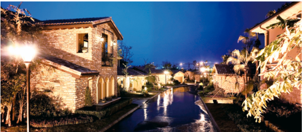
重慶藍湖郡 Chongqing Blue Lake County

During 2010, the Group acquired 11.97 million square meters of land in terms of GFA, of which 82% was located in the Pan Bohai Rim region, 9% in the Yangtze River Delta region, and the remaining 9% in Western region. The average acquisition cost per square meter was RMB1,795. Strategically, we were able to enter the cities of Yantai, Yuxi, Dalian as well as maintaining a relatively low land cost with high potential. In early 2011, the Group further acquired land plots in the West Park of Chengdu's high-tech zone and the new coastal city of Beicang in Ningpo city, with a total planned GFA of 1.22 million and 0.63 million square meters, respectively.