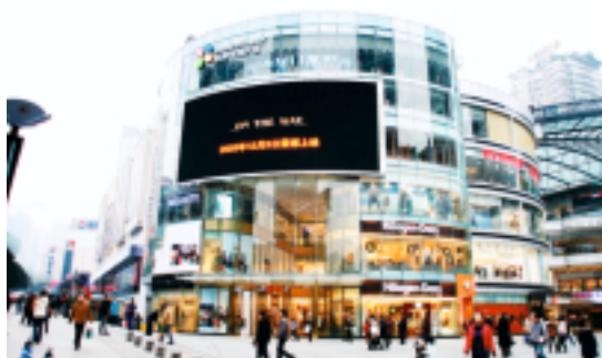
重慶北城天街 Chongqing North Paradise Walk

With the operation of new malls and renovation and upgrade of existing malls, the Group's rental income from investment properties for 2010 grew rapidly with an increase of 45.1% to RMB0.29 billion. Gross profit margin from rental income rose from 78% in 2009 to 79% in 2010. The anchor store in North Paradise Walk, which underwent renovation and was repositioned as a trendy shopping area featuring middle to high-end fashion shops, was able to collect much higher rent, thus increasing rental income by 56.8%. West Paradise Walk's anchor store has also completed renovation and upgrade at the end of 2010. The Chengdu Three Thousand Mall and the Chongqing MOCO Center both commenced operation in the second half of 2010 and occupancy rates have achieved nearly 100%, thus assuring a rapid rise in rental income for the future.