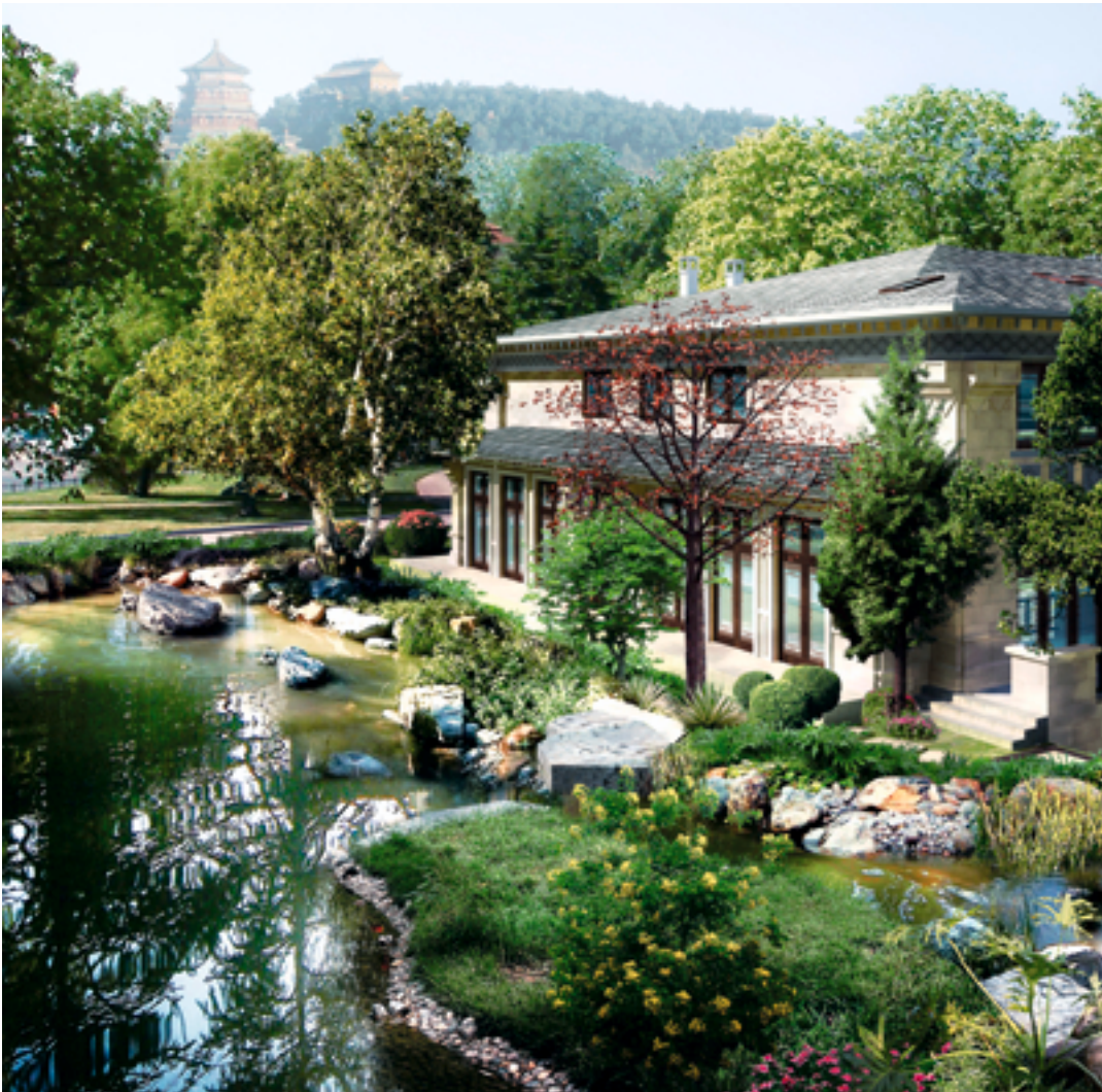
北京頤和原著 Beijing Summer Palace Splendor

In 2010, the Group's contract sales demonstrated strong growth of 81.5% as compared to 2009, reaching a total contract sales of RMB333.2 billion. Revenue was RMB150.9 billion, representing an increase of 32.7%. Rental income from investment properties recorded an increase of 45.1% over last year, while revaluation gain on investment properties reached RMB24.9 billion. Profit attributable to shareholders increased by 87.0% to RMB41.3 billion. Core profit attributable to shareholders was RMB25.7 billion, representing an increase of 59.9%. Net profit margin rose from 19.4% in 2009 to 27.4% in 2010. Core net profit margin rose from 14.2% to 17.1% over last year.