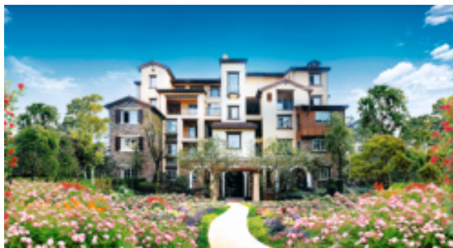
杭州澗瀾山 Hangzhou Rose & Ginkgo Villa