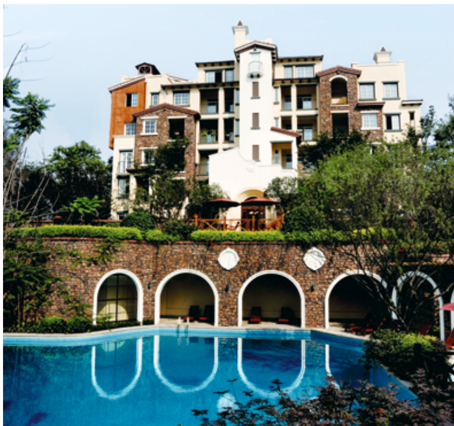
成都弗萊明戈 Chengdu Flamenco Spain

Approximately RMB5.47 billion of the Group's consolidated borrowings were quoted at fixed rates ranging from 3.08% per annum to 6.70% per annum depending on the tenors of the loans; the rest were quoted at floating rates. On December 31, 2010, the Group's average cost of borrowing was 5.6% per annum. The ratio of unsecured debt to total debt rose from 26.3% in 2009 to 46.6% in 2010. Ratio of fixed interest debt to total debt rose from 29.4% in 2009 to 31.5% in 2010.