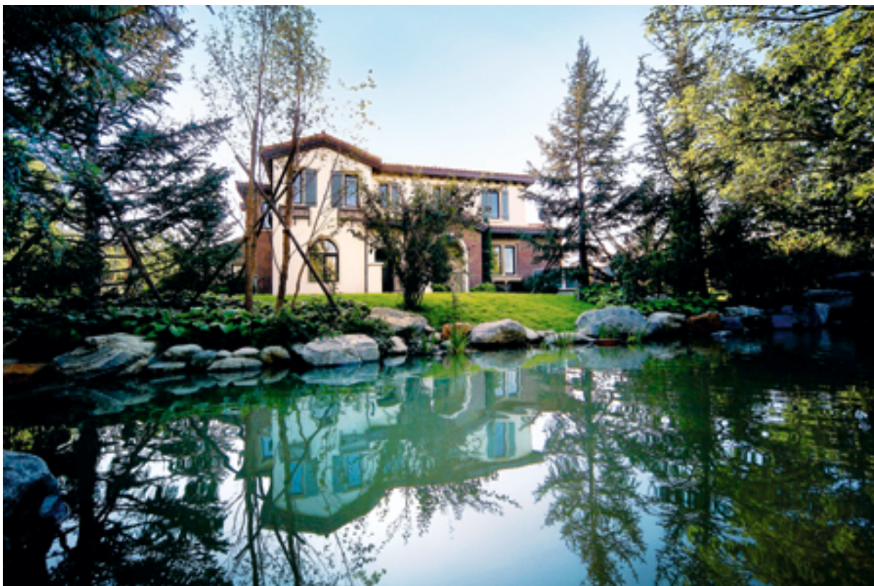
北京澗湖山 Benjing Rose & Ginkgo Villa

As of December 31, 2010, the total land bank of the Group was 31.61 million square meters or 28.24 million square meters on an attributable basis. The average acquisition cost of our land bank was RMB1,935 per square meter. In terms of regional breakdown, Pan Bohai Rim, the Yangtze River Delta, and Western China accounted for 42.2%, 16.8% and 40.9 % of the total land bank, respectively. The geographic spread at the land bank of the Group was as follows: