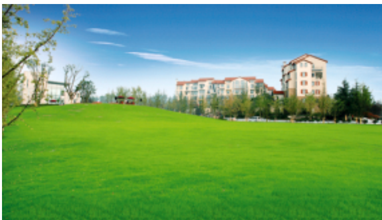
重慶江與城 Chongqing Bamboo Grove