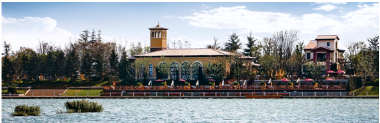
青島灘潤海岸 Qingdao Rose & Ginkgo Coast

The Group remunerates its employees based on their performance, work experience and the prevailing market wage level. The total compensation of the employees consisted of base salary, cash bonus and share-based rewards. Cash bonus is a large part of senior employees' cash compensation which is a function of, amongst other things, the net profit of the individual subsidiaries, the return on invested capital, results of a balanced score card system and operating cash inflow, etc. On top of two pre-IPO share award